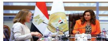
agring sign for the government's wider 2024-2027 national reform plan.

The initiative has also advanced Egypt's decentralization agenda and significantly increased private sector participation, benefiting over 72,000 companies. Surveys show that around 85% of business owners reported satisfaction with the programme's support—an encour-