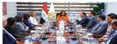
ment cooperation between Egypt and the World Bank.

Awad highlighted the longstanding partnership with the World Bank since the programme's launch in 2018, expressing gratitude for the Bank's continued support, which has led to substantial achievements across key governorates. She described the initiative as a flagship model of develop-