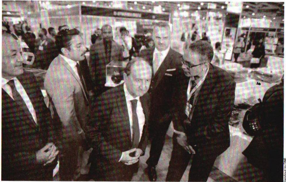
The Big 5 Construct Egypt, held at the Egypt International Exhibitions Centre