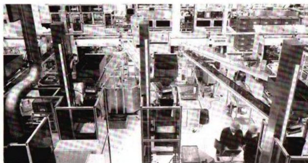
Novo Nordisk Kalundborg is the largest insulin production facility in the world and is a cornerstone of the company

We also began a summer camp for children with diabetes called "Changing Diabetes in Children" organised with the Diabetes Youth Care Association. During the camp, Novo Nordisk Egypt provided an innovative and interactive atmosphere for the children to teach them the best ways to manage their diabetes and information on insulin, healthy diets, foot care, exercise, and other advice so that they can enjoy a better, longer, more productive life.