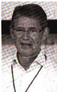
Lars Rebien Sorensen was ranked the world's best CEO by Harvard

Like his company, which has been active in Egypt for over 80 years, CEO Lars Rebien Sorensen exudes confidence and competence. He has been ranked by Harvard as the best CEO in