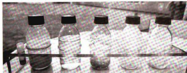
Novo Nordisk began a summer camp for children with diabetes called "Changing Diabetes in Children"

lent to 14.8% of the adult population. Egypt has the eighth highest preva-