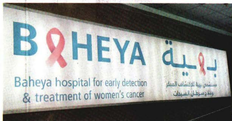
Baheya, established on an area of 1,000 sqm, was named after a woman who died from breast cancer